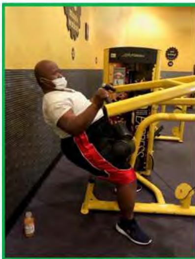
At the Gym

Innovations, for several years now. With the help of his shared living provider, he continued his healthy lifestyle by going to the gym. He has been practicing social distancing at the gym and outside. He wears a mask in stores, and especially when visiting his favorite place, Dunkin! He enjoys working out and has had an amazing weight loss during quarantine.